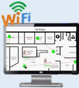
Optimal WLAN Planning