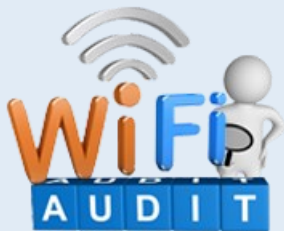
On-Demand Audit Optimization