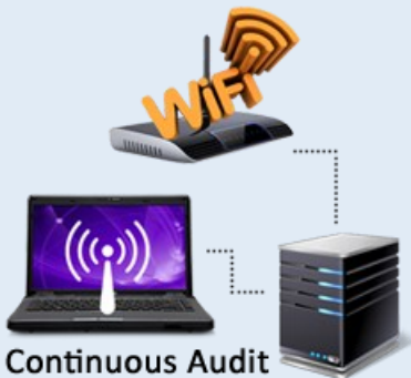
Continuous Audit Tuning